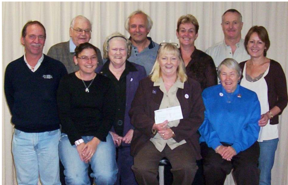
ABB AUSTRALIA FAREWELL GIFT

GARDS was thrilled to accept a donation cheque from ABB Australia who has been working for 6 years at the Yallourn W Power Station site. Their contract is now completed and those who have been working there are moving on to other places in Australia and overseas. We believe we have been very lucky to get to know this wonderful bunch of workers and we have been very fortunate to be the grateful recipients of two donations from them in the last 12 months.