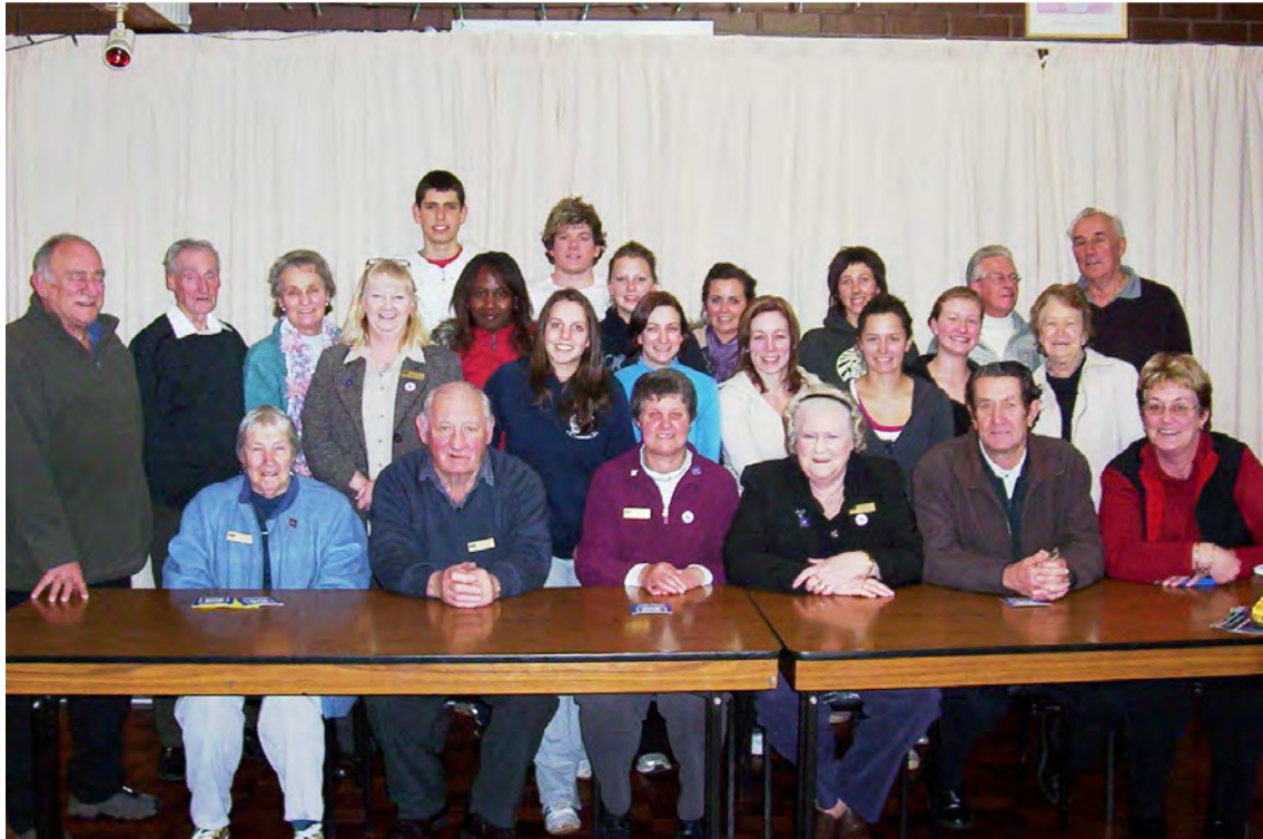
Pictured here are the students, Lecturers and the GARDS gang