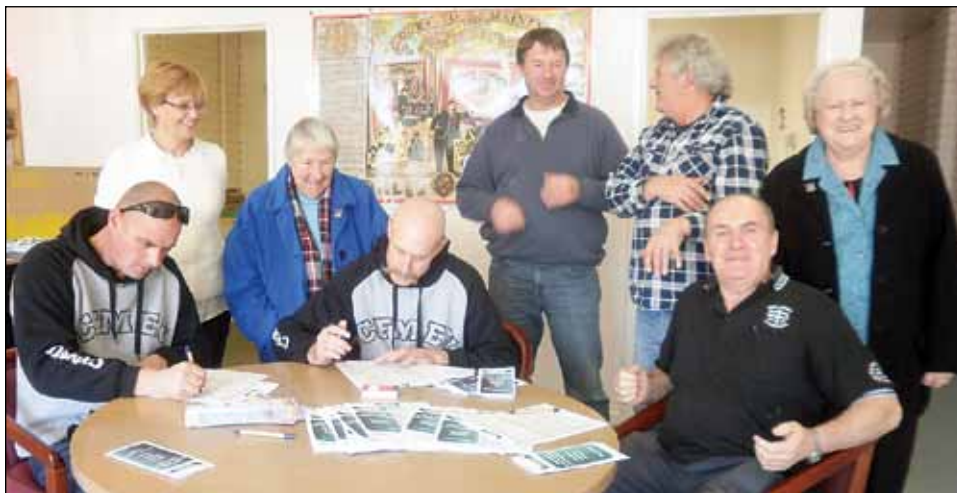
Pictured above are members of the Gippsland Trades and Labour Council and Asbestos Council of Victoria/GARDS with unionists signing up for Member Benefit cards.

The Launch of the GTLC's Associate Member Program will see a range of Valley-based community organisations receive extra funding through weekly members donations.