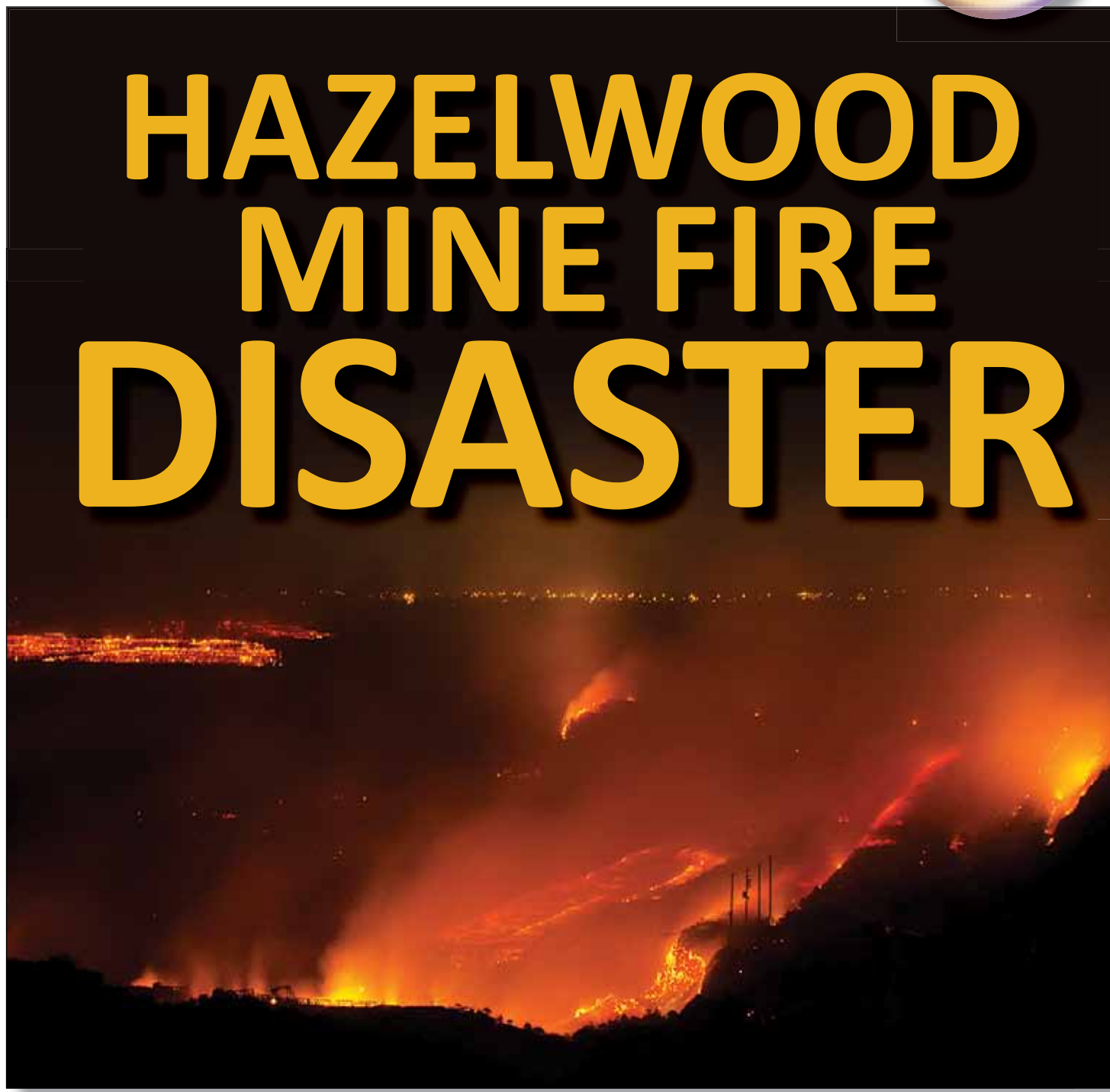
The fire started in the mine on the 9th February 2014

You can find our link on the home page of the GARDS website or at facebook.com/GARDSInc