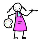
One of the art pieces in the display

We would love to see all of you join us for this occasion and show families from the Gippsland community how much you care.