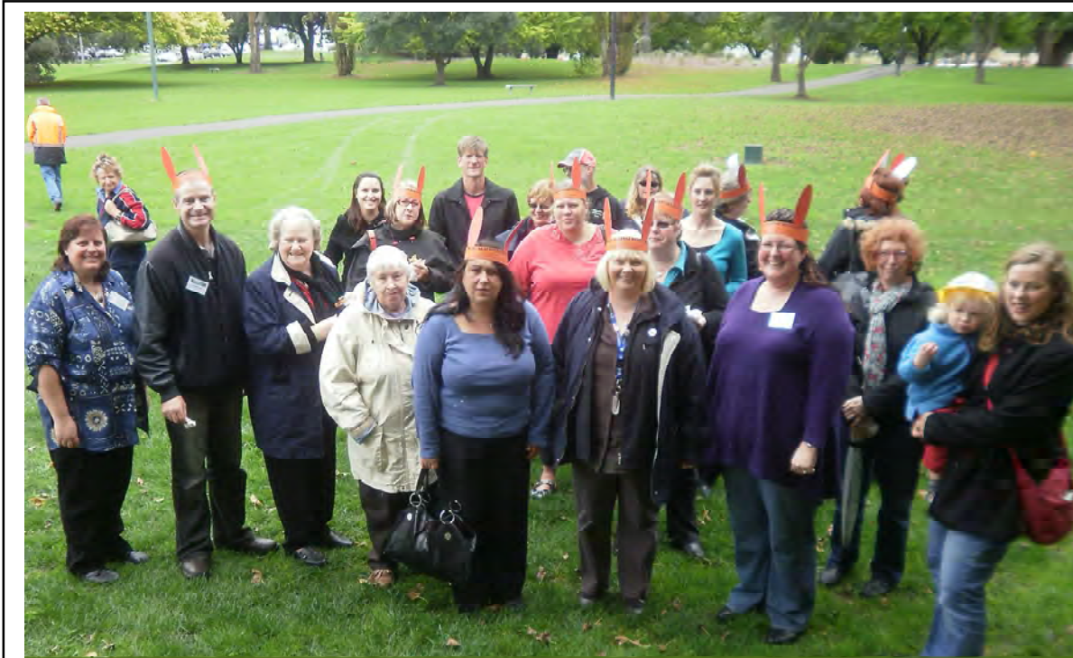
Pictured left are: Some of the general public & Women's Action Coalition group members who attended the Speak out Against Bullying on Big Ears Day , held in Traralgon's Victory Park.