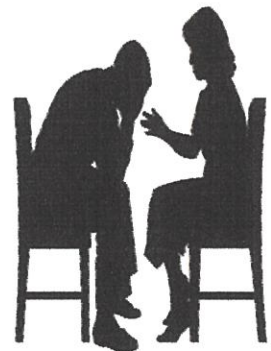
Understanding Loss, Grief and Bereavement

The course will cost approx $120 per person (we have applied for funding and hope to be able to off set this cost for participants). The course will be conducted at the GARDS premises on 4 consecutive Fridays which will commence at 1.00pm—4.00pm If you are interested in doing this course it will be conducted in approx May-June. If you would like to know more about this course and would like