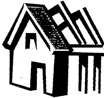
Asbestos cement sheeting removed badly causes dust emissions