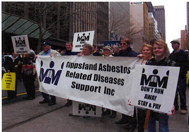
GARDS MEMBERS ON THE PROTEST MARCH TO THE STOCK EXCHANGE

PROTESTING ON THE STEPS OF PARLIAMENT HOUSE 8 TH OF SEPTEMBER, 2004