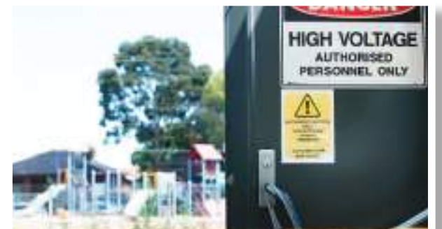
Electrical Tram Substation in Melbourne