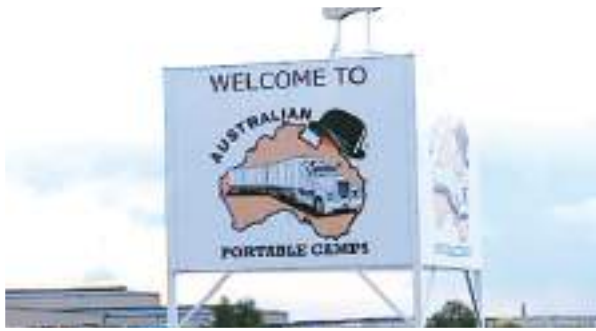
Australian Portable Camps