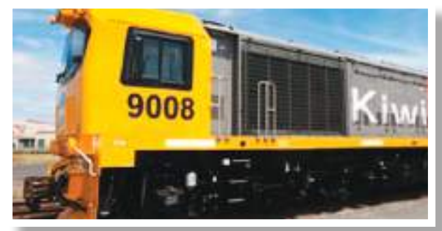
2013/14 Chinese trains imported to New Zealand and Australia