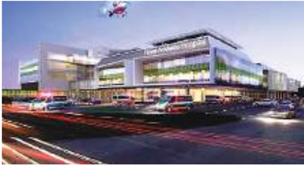
Royal Adelaide Hospital