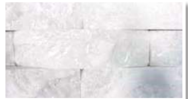
Tremolite Decorative Stacked Stone