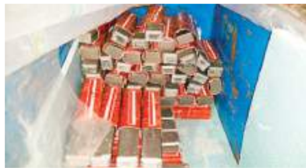
Nut plug drilling lubricant