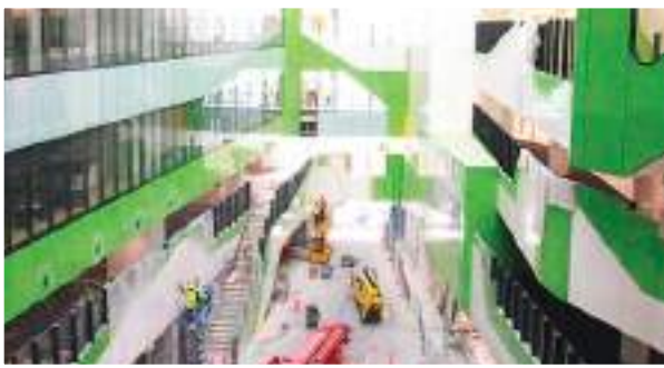
Perth Children's Hospital