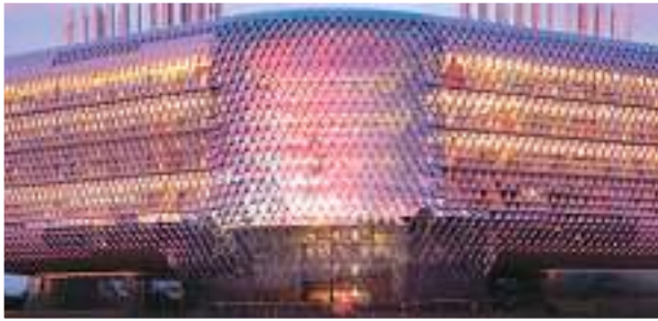
Health and Medical Research Institute