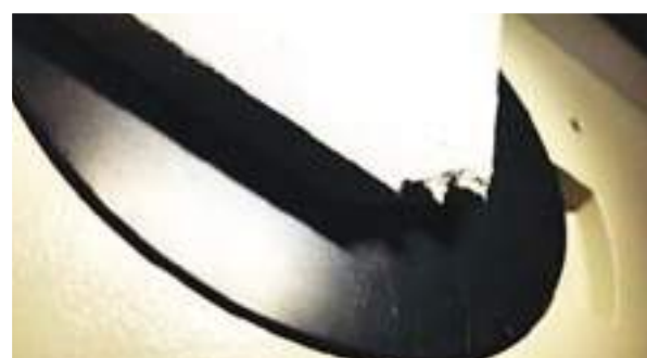
Concrete fibre cement imported in 2012