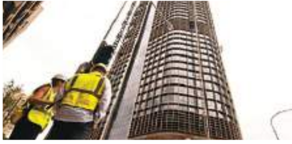
Queensland Government new executive building known as the Tower of Power