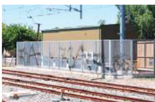
Seaford SA Train Substation