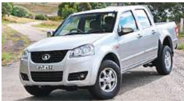
Great Wall vehicles imported in 2012