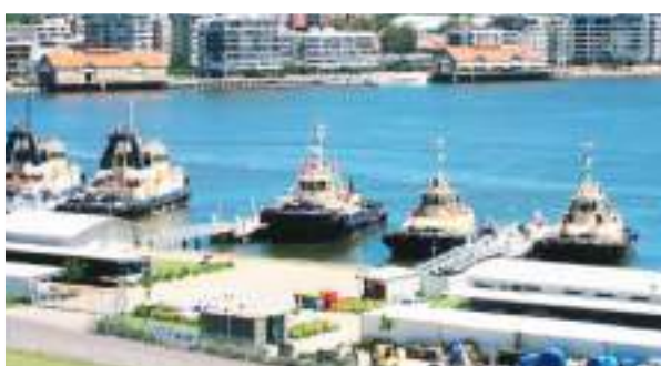
Tug Boats Port of Newcastle